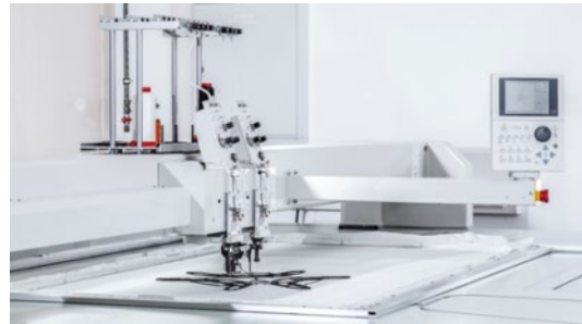
Fig. 1: TFP-process at IPF

Within the project “Tailored fibre placement (TFP) on recycled carbon fibres (rCF) -nonwovens”, funded by the “Sächsische Aufbaubank – SAB”, the Leibniz-Institut für Polymerforschung Dresden e.V. – IPF and Sächsisches Textilforschungsinstitut e.V. – STFI investigate the applicability of rCF-nonwovens for the TFP-Process. Therefore (mainly primary) Carbonrovings are embroidered onto rCF-nonwovens to produce net-shaped and load bearing preforms. This enables on one hand load adapted fibre orientations and on the other hand recyclable designs and a resources saving production.