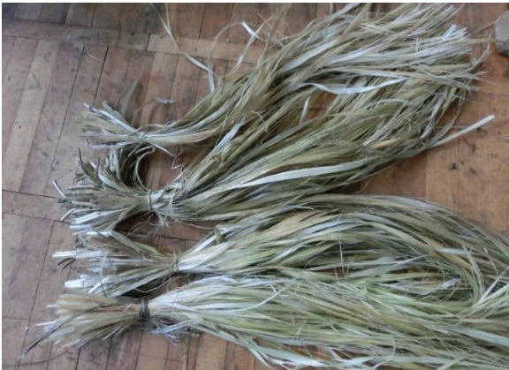
Figure 1 - Peeled Manually Bundled Hemp Bast