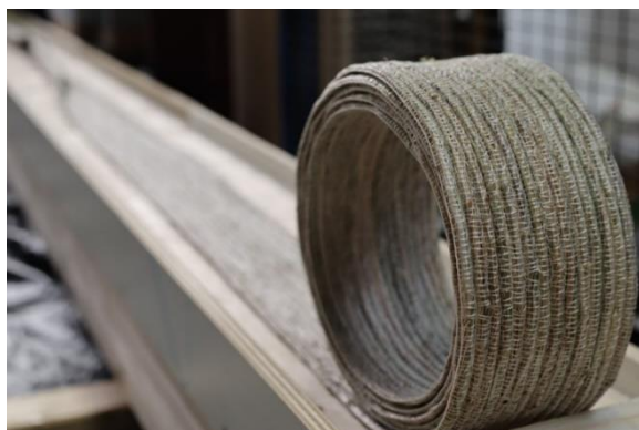
Figure 2 and 3: Application of hemp bast straps on the wooden beam