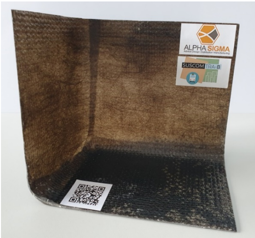
Fig. 1 Demonstrator "suitcase corner" developed in cooperation with Alpha Sigma GmbH

During the project, a first demonstrator ("suitcase corner", fig. 1) was produced using the resin infusion process on the basis of basalt fiber nonwovens at Alpha Sigma GmbH, Zwickau. Furthermore a mold from Alpha Sigma GmbH, Zwickau, which is a part of a C-pillar, was used for demonstrator purposes. In the vacuum infusion process, various demonstrators were created on the basis of the developed reinforcement structures, with the nonwovens being particularly convincing due to their good drapability. The drapability prevented wrinkles at the curvatures of the mold and thus enabled good surface quality (see figure 2).