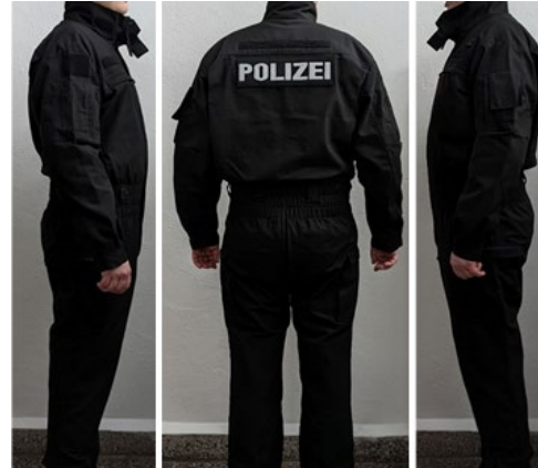
Innovative heat-resistant fabric offers emergency services protection against Molotov cocktail attacks.