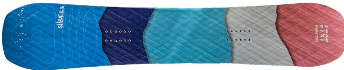
Green snowboard from silbaerg GmbH based on hemp fibres and recycled carbon fibres