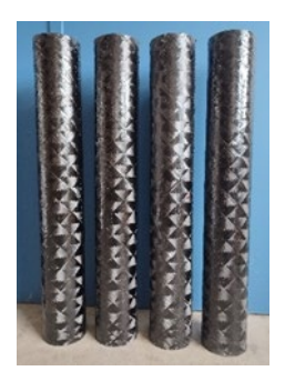
Wooden tubes with cross winding