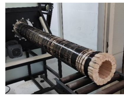
CF-reinforcement against restoring forces

In the project, a system was developed and built on which round wooden profiles arranged in a ring are pressed into wooden tubes. The woodtrusion system complex includes a material magazine, automatic loading based on the turret principle and a heated press unit. In the press unit, the wooden profiles are pressed through a conical nozzle and compressed there. A winding unit is positioned at the nozzle outlet, which reinforces the exiting wooden tube with towpregs in an orbital winding process and thus compensates for the restoring forces of the wood. The temperature of the wood of 120 - 150 °C is used to harden the towpreg resin system. The plant works continuously and can produce pipes of any length.