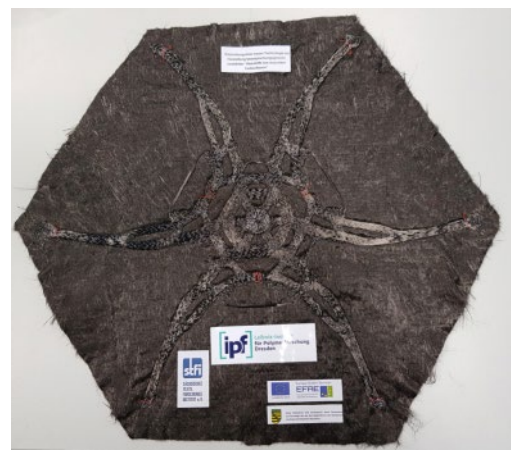
Fig. 4: Lightweight stool on 100 % rCF-nonwoven