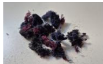
Textile fiber dust