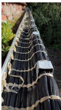
Frost-resistant capillary irrigation